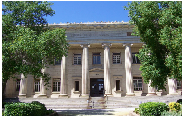
ERECTED IN 1920