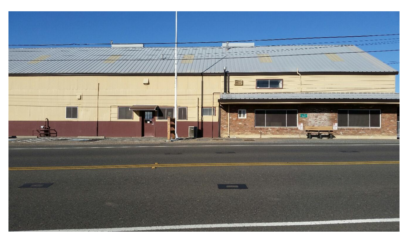
Tehama County Public Works Department