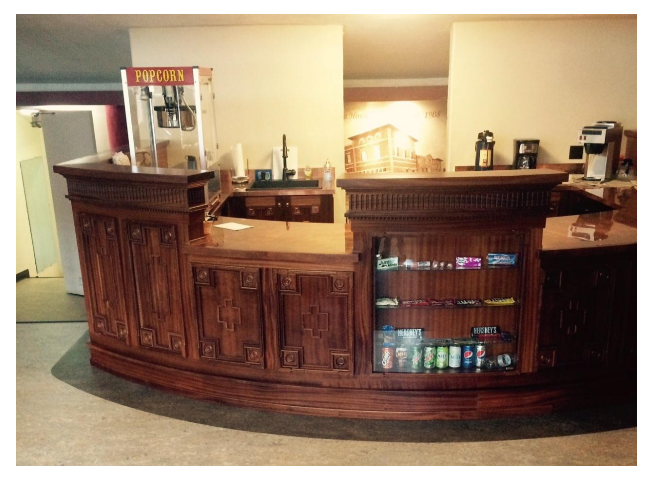
Concessions stand at Red Bluff State Theater crafted by DRC Woodshop