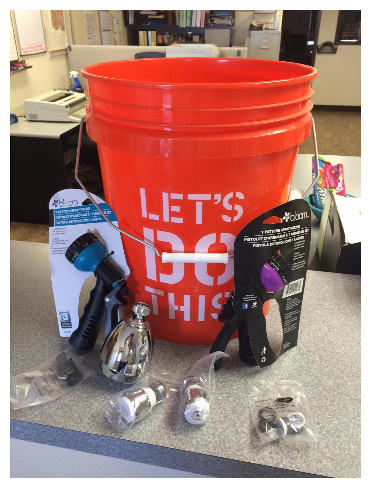
Water Conservation Kit available at Tehama County Public Works Department