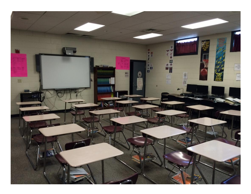
Classroom at Juvenile Hall